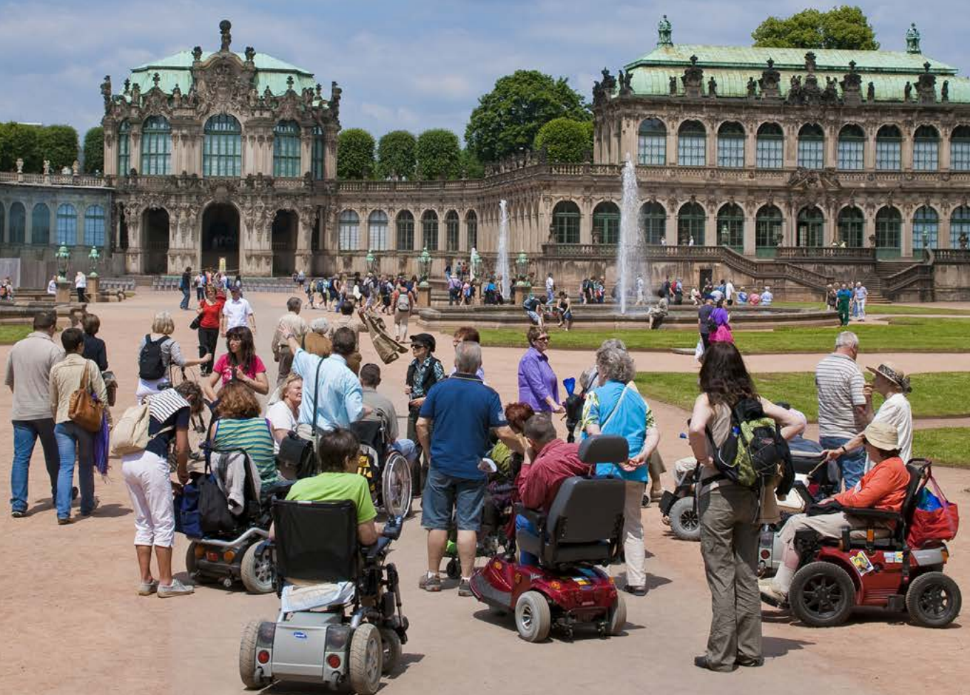
Wheelchair and mobility scooter meet-up in front of Dresden Zwinger, Saxony