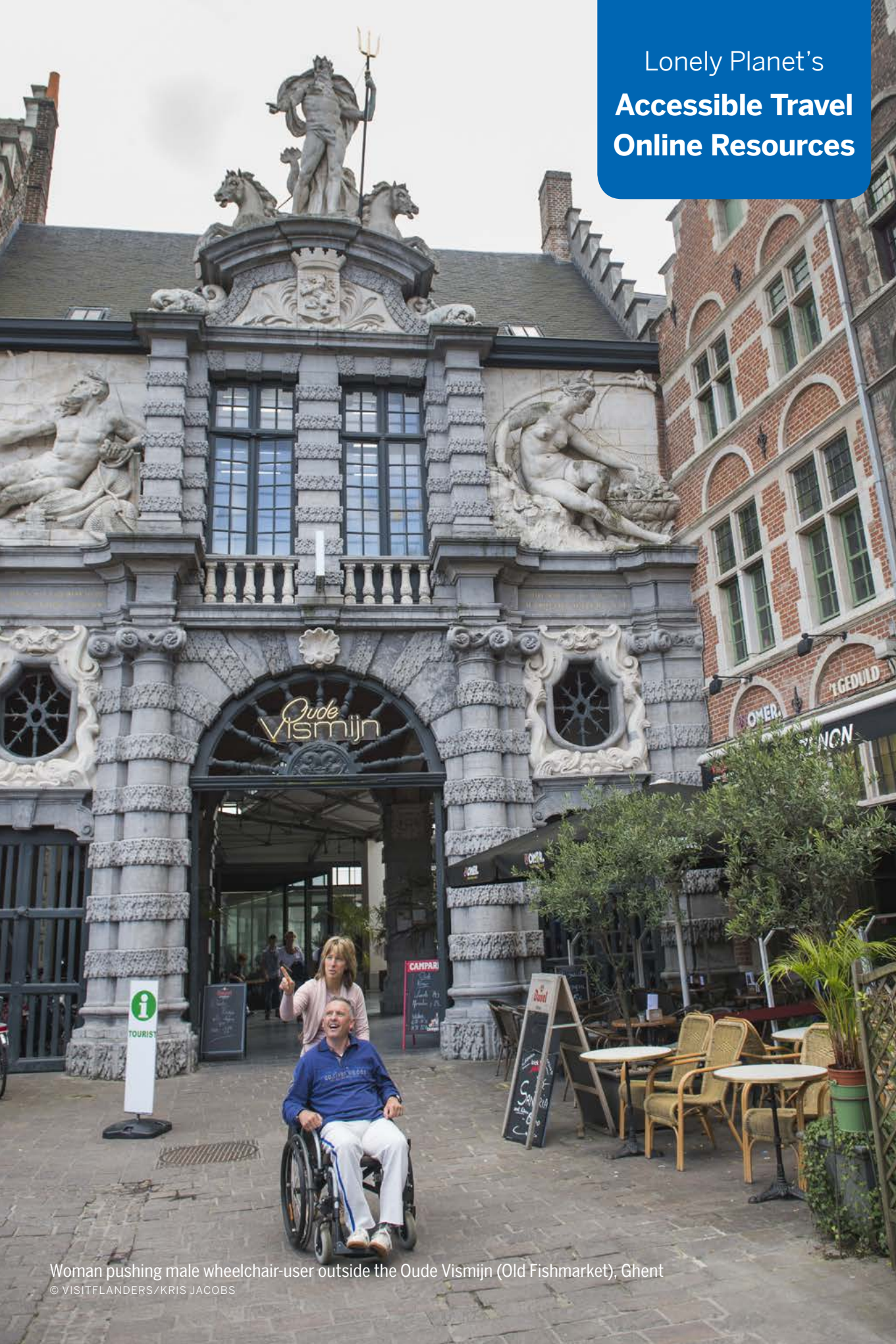
Woman pushing male wheelchair-user outside the Oude Vismijn (Old Fishmarket), Ghent