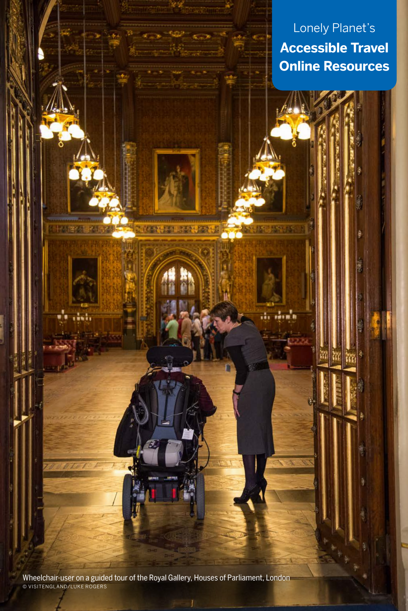
Wheelchair-user on a guided tour of the Royal Gallery, Houses of Parliament, London