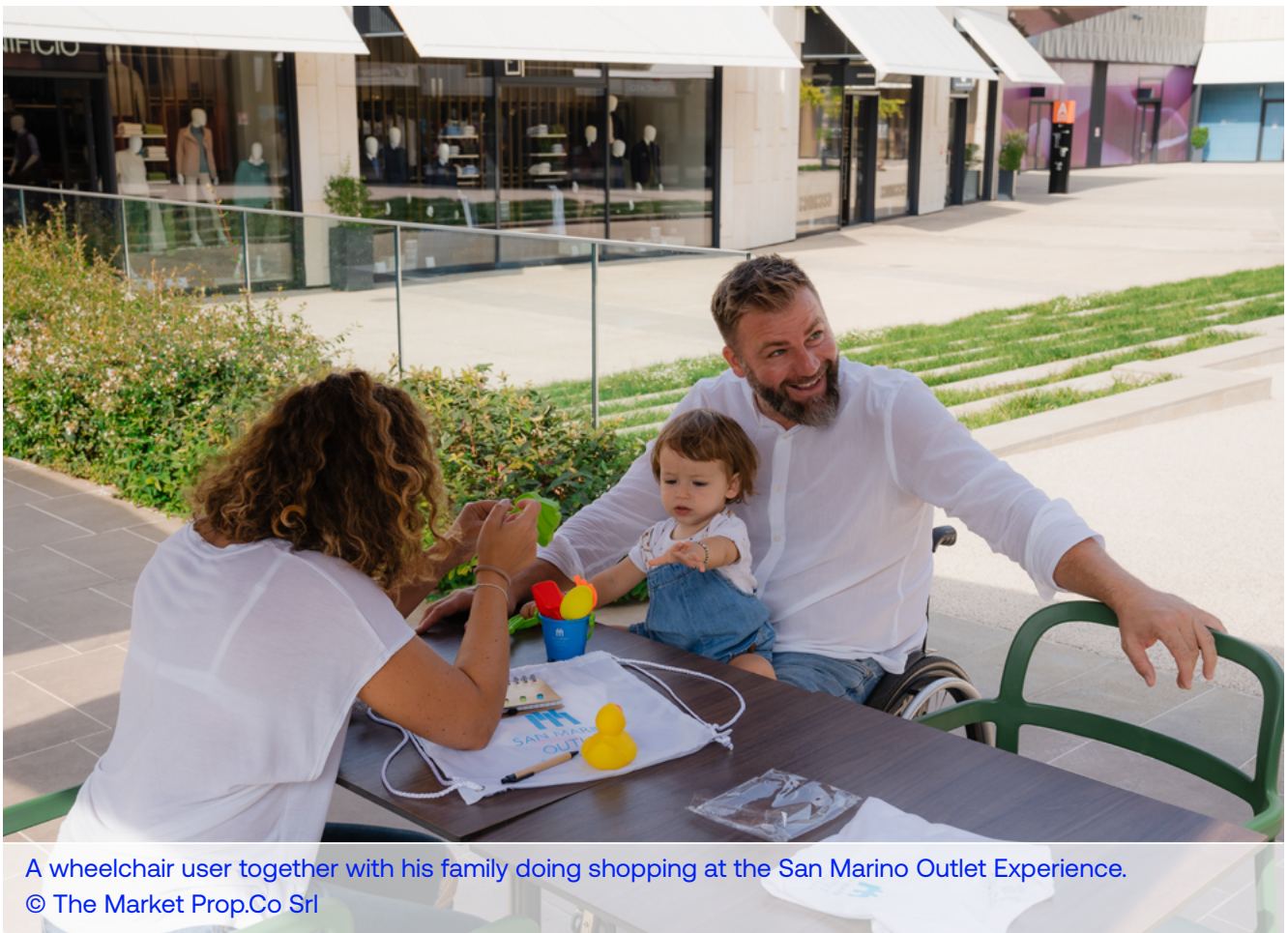
A wheelchair user together with his family doing shopping at the San Marino Outlet Experience.

As San Marino and the Italian region of Romagna are known for their hospitality, being hospitable also implies being inclusive . It is crucial for the outlet staff and its stores' employees to have skills to attend to clients with disabilities, to provide information and support customers with specific access requirements in the most adequate way. It is also critical to effectively communicate and promote accessible offerings, conveying the message that the San Marino Outlet Experience is free from architectural barriers and other kind of obstacles.