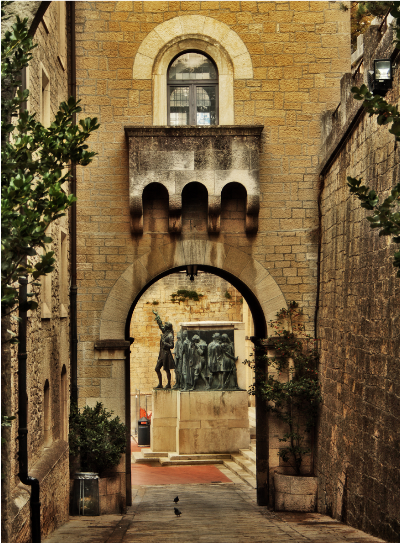
City Gate into Walled San Marino.