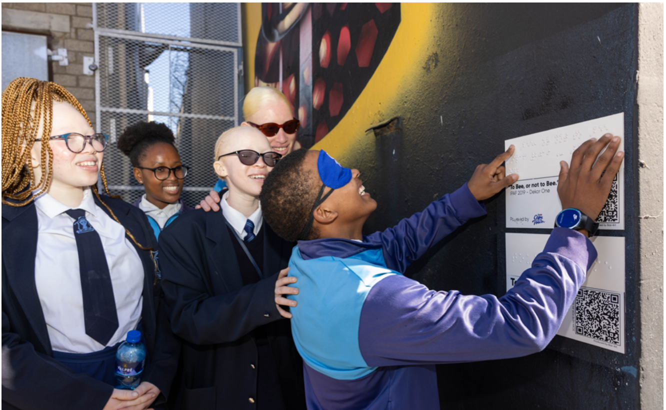
Group of people with visual impairments enjoying a guided tour thanks to braille touchpoints describing the attractions.

valuable information enabling visitors to plan holidays based on their personal access requirements, allowing listening capability to those using their website. The website displays a selection of restaurants and barrier-free dining destinations, wheelchair friendly activities and attractions, as well as detailed information about accessibility at the airport. CCT has also hosted a number of inclusive activities including “Dinner in the Dark” events, partnering with the Cape Town Society for the Blind.