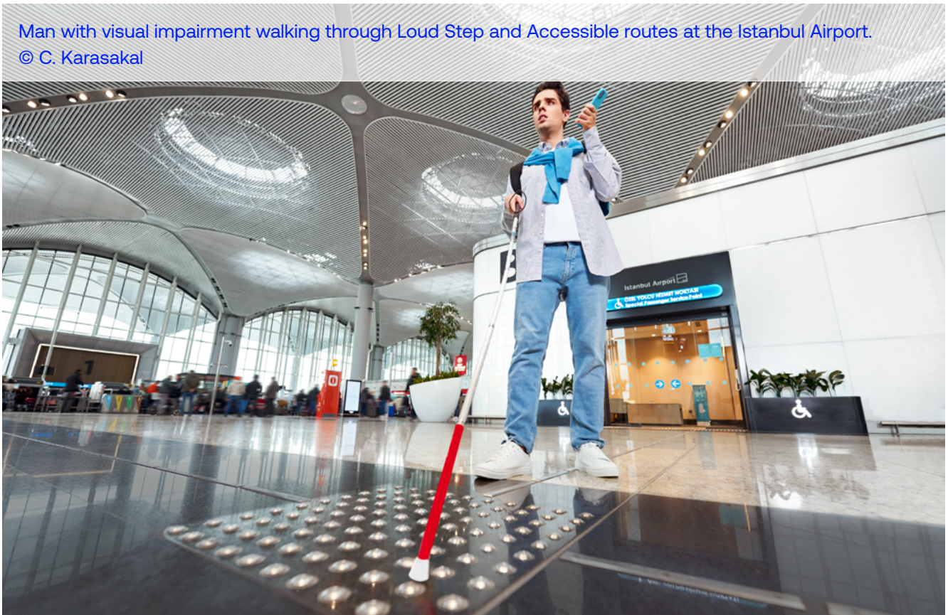
Man with visual impairment walking through Loud Step and Accessible routes at the Istanbul Airport.

travel experience for all and creating inclusive training modules for aviation professionals and students. Additionally, Istanbul Airport is engaged with the Accessibility Committee led by the Ministry of Transportation and Infrastructure of Türkiye, with representatives of governmental agencies, private and public entities from the transportation sectors, and organizations of people with disabilities.