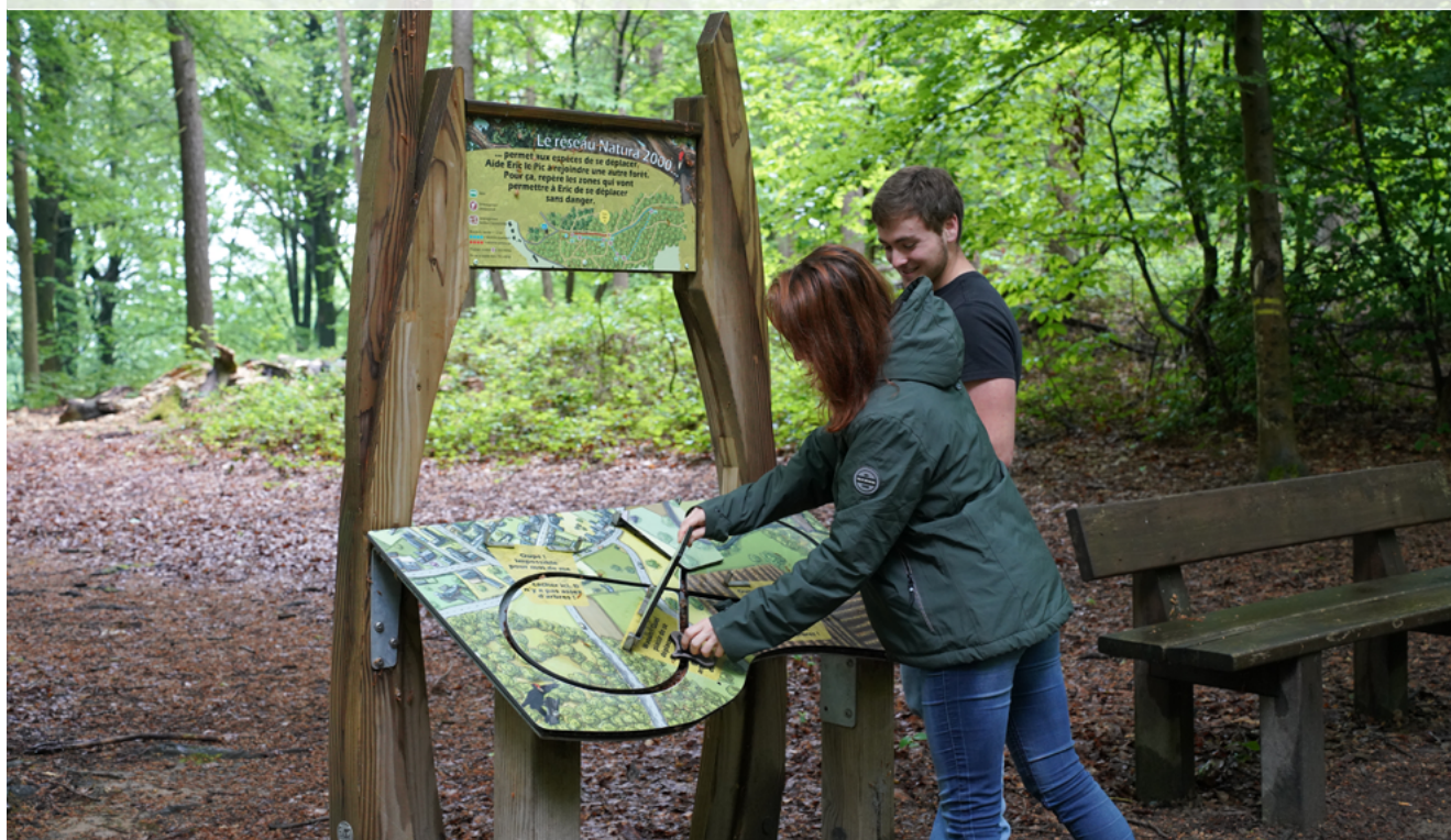
A girl and a boy practicing on an education module adapted to people with disabilities.

area. The walk follows a ring equipped with simple and intuitive signage, handrails, and an adapted picnic table at the trail's entry point. The connections between the various boardwalks and the trail are smoothly integrated. The trail has been made accessible to visually impaired people, through audio description tracks downloadable from the website. The main challenge during the project roll-out was to produce tangible solutions under budgetary constraints. The staff of the natural parks worked with Access-i 47 and its designers. Different municipalities,