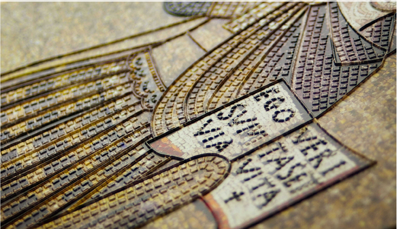
Tactile and speaking reproduction of Ravenna mosaics.

with audio descriptions have been thought out to allow people with visual impairments to enjoy the artworks.