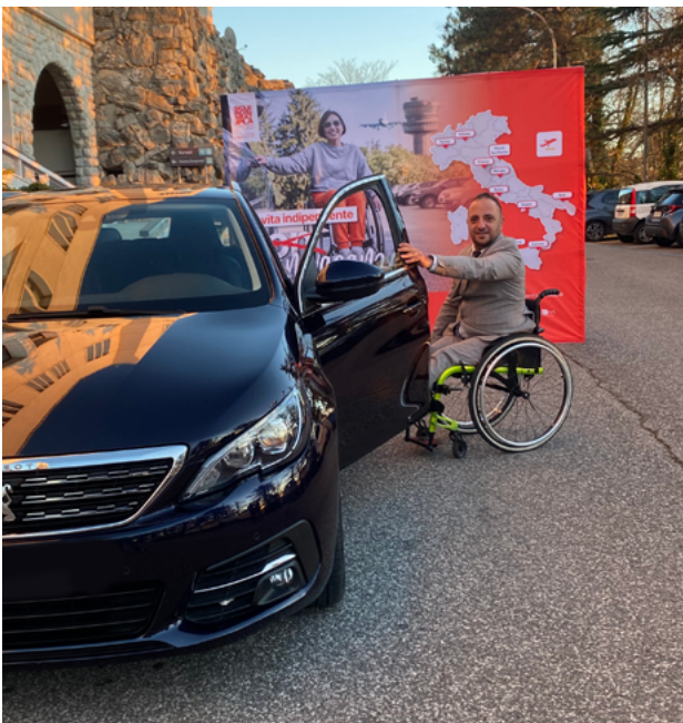
A man, wheelchair user, opens the door of a car modified to allow driving by people with disabilities.

The key partners are the Italian Multi-Sclerosis Society (AISM), BIL Benefit, public institutions, and companies, each playing a specific role. AISM holds ownership of the project and is entrusted with fine-tuning the inclusive rental model. BIL Benefit supports research, promotion, and partnerships. On the operational front, private partners provide the vehicles and manage the service, offering their infrastructure expertise and business know-how. The pilot project has been initiated at the airports of ten major Italian cities – including Bari, Catania, Florence, Milan, Palermo, Perugia, Pisa, Rome, Trapani, Turin – and is expected to be completed by 2025.