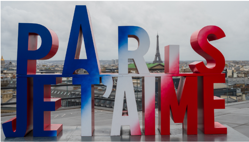
Paris je t'aime large standing letters in front of Paris skyline, France.