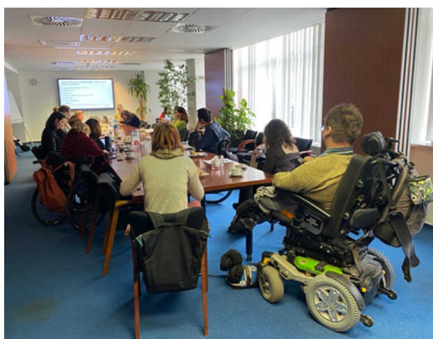
A working group discussing accessibility initiatives during a meeting in Prague.

Activities comprise an accessible pool with a lift at Aquaworld, an inclusive treetop walkway and a universally accessible bobsleigh track. The accessible offerings are complemented by accommodations and restaurants, equipped with services to ensure excellent experiences for visitors with disabilities, enabling all to enjoy the region.