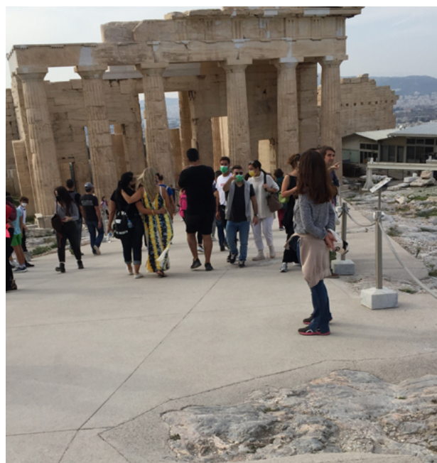
New pathway at the Athens Acropolis made of a specific concrete to provide a smooth and non-slippery surface.

The accessibility interventions at the Acropolis archaeological site represent a successful application of UD principles and technology, while respecting its heritage values: In 2021, a new custom-designed lift for access to the top, and broader pathways, made of a specific concrete laid on a membrane, were installed. The latter provides a non-slippery surface, while protecting the rock and archaeological remains.