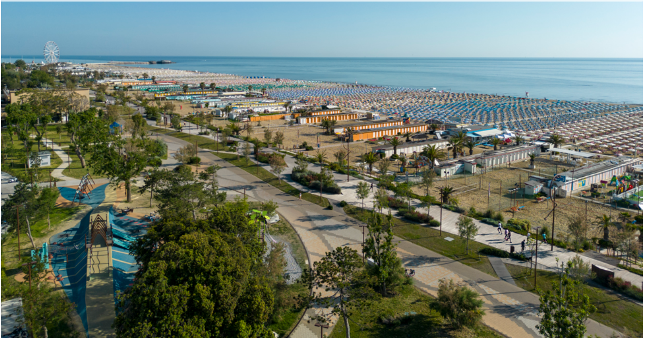
A view of the Sea Park playground in Rimini.

crucial. Nevertheless, the challenge lies in interpreting norms and standards, addressing diverse abilities, and creating inclusive spaces. Beyond meeting minimum standards, designers must adopt and innovate in ad-hoc solutions to specific problems, reducing both physical and social barriers. The Sea Park project is an example of a people-centred approach, benefitting the entire community.