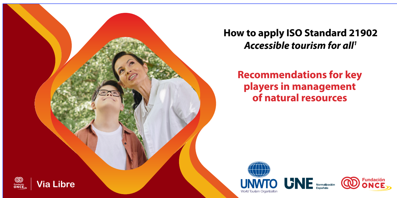
Cover page of the UN Tourism Recommendations for key players in management of natural resources.